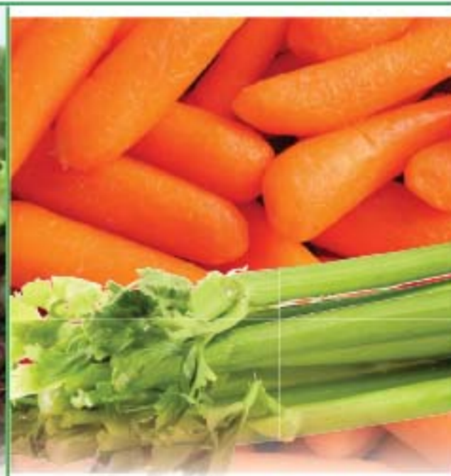
Celery or Mini Carrots