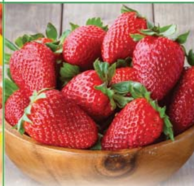
Strawberries 1 lb. Clamshell