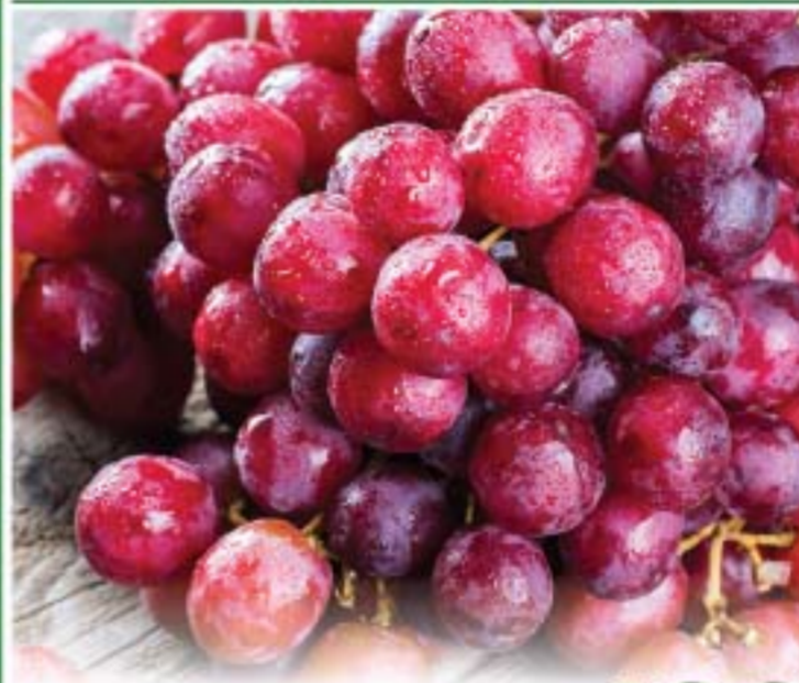
Seedless Red Grapes