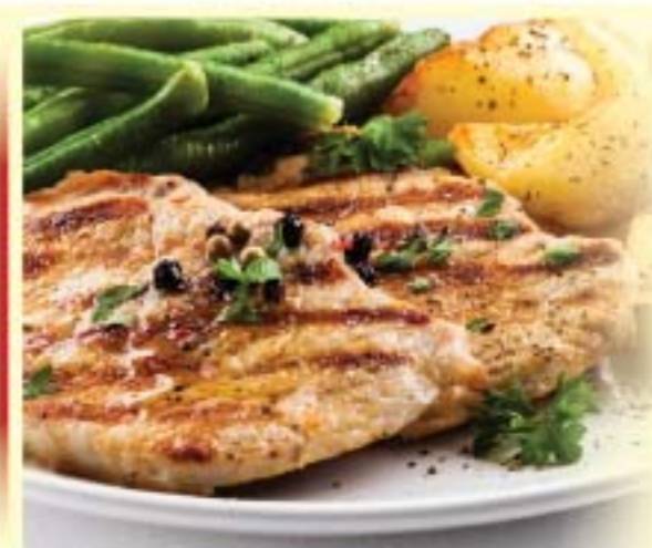
Chicken Cutlets 2.99 lb.