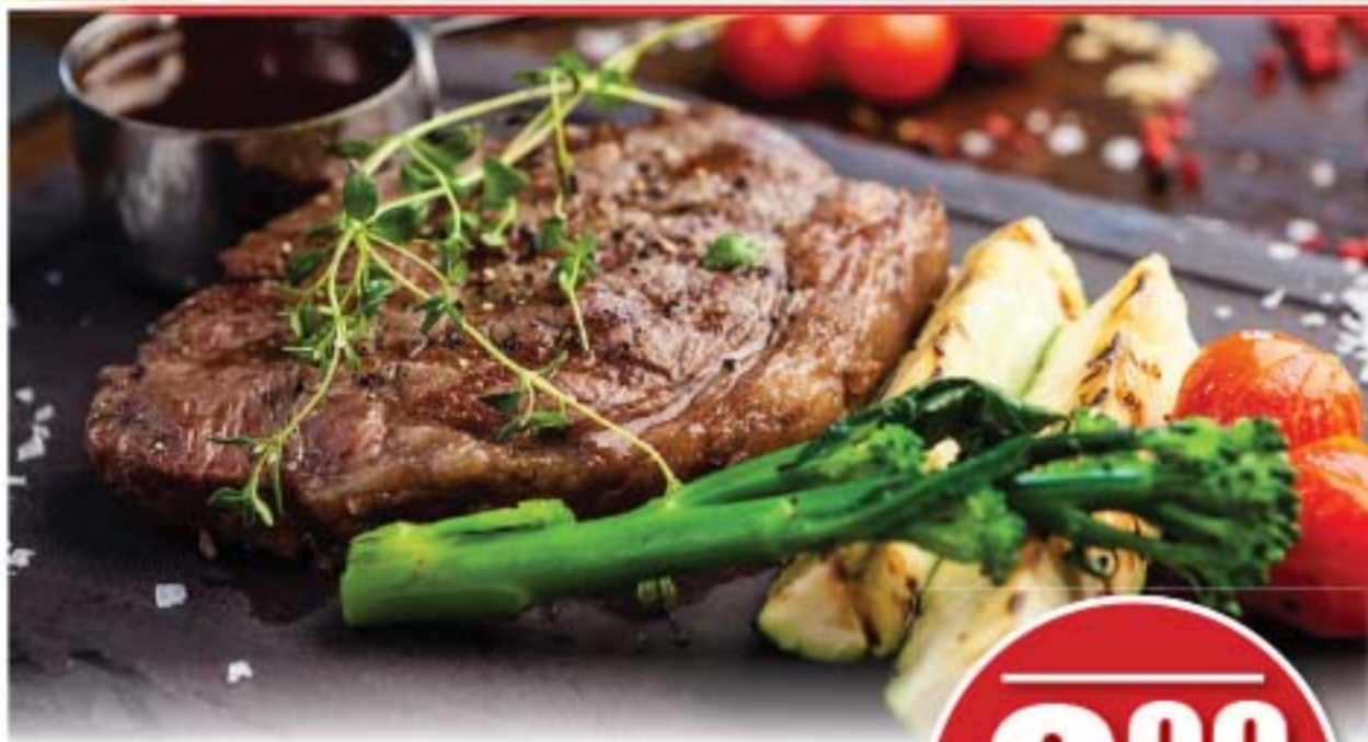
Thin Bottom Round Steaks