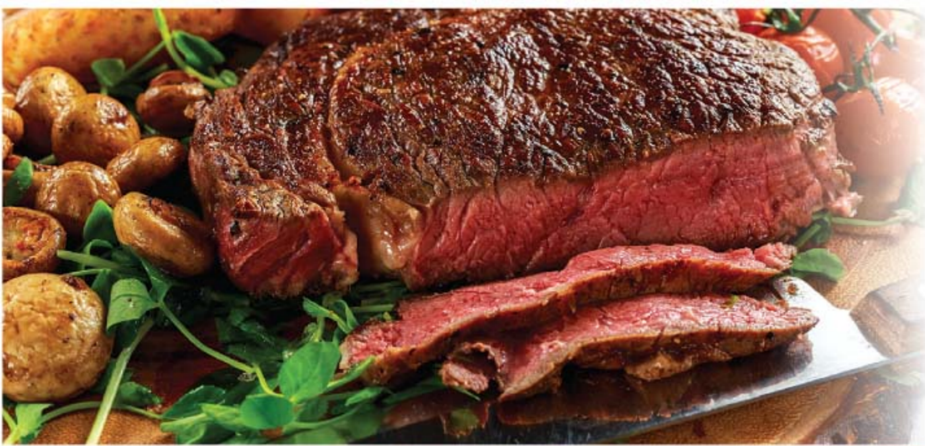
Bottom Round Steak Family Pack