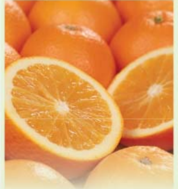
Large Navel Oranges