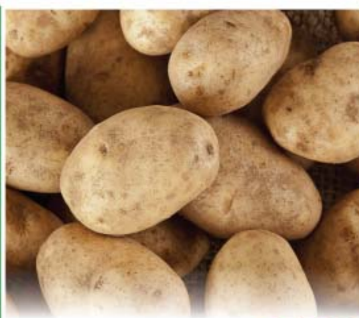
Potatoes 5 lb. bag