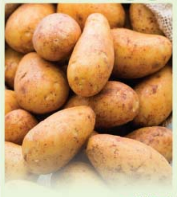
Potatoes 5 lb. bag