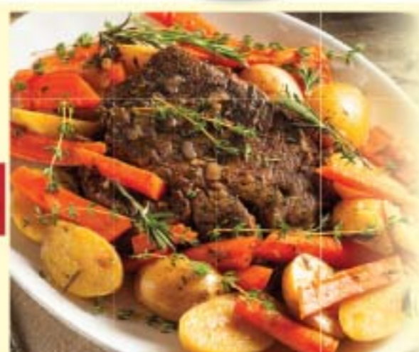
Chuck Roast 4.99 lb.