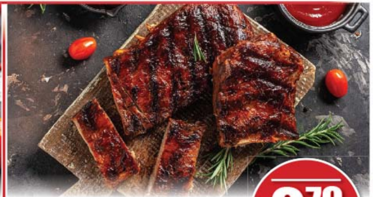
Bone-In Pork Country Style Ribs