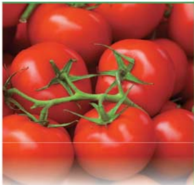
Hothouse Tomatoes On the Vine