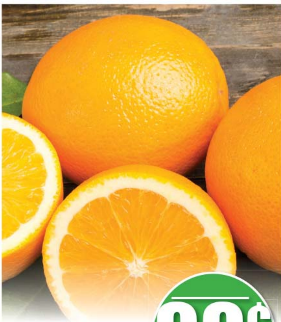
Large Navel Oranges