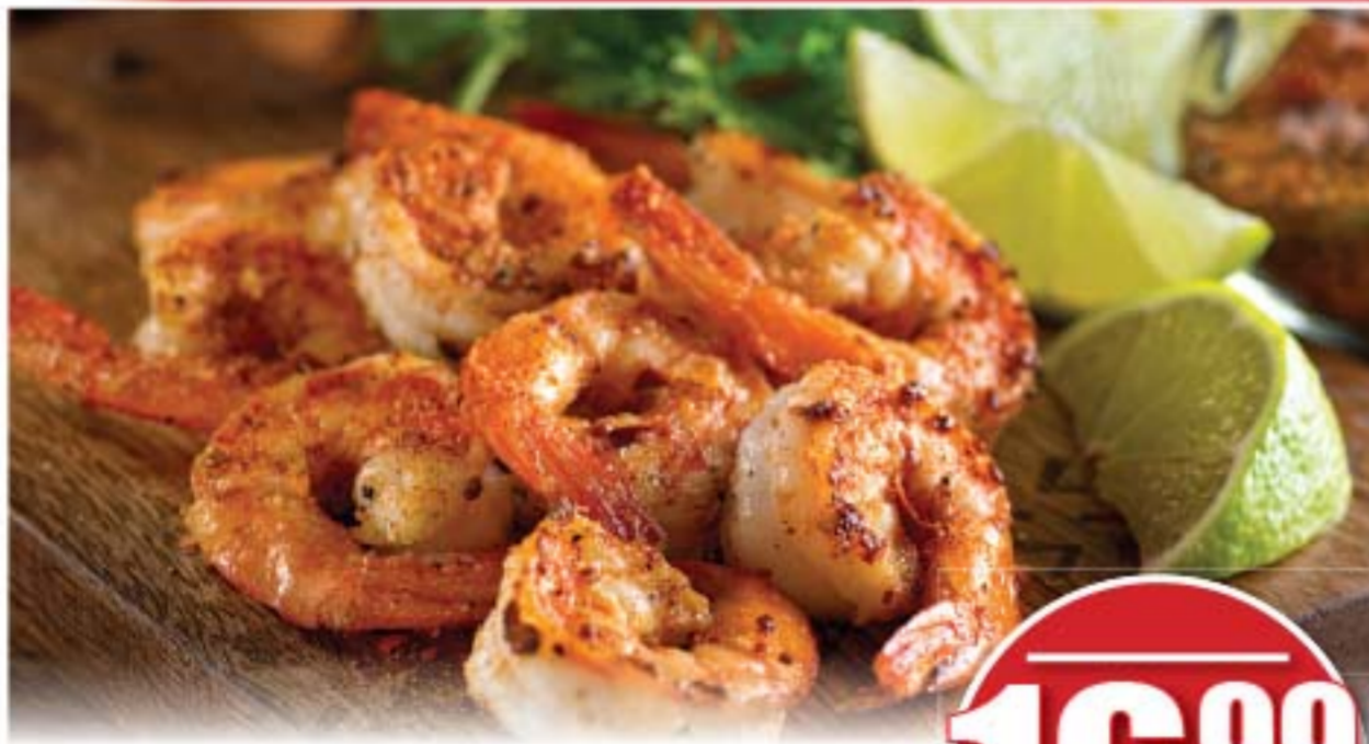
41/50 Cooked Shrimp 2 lb. bag