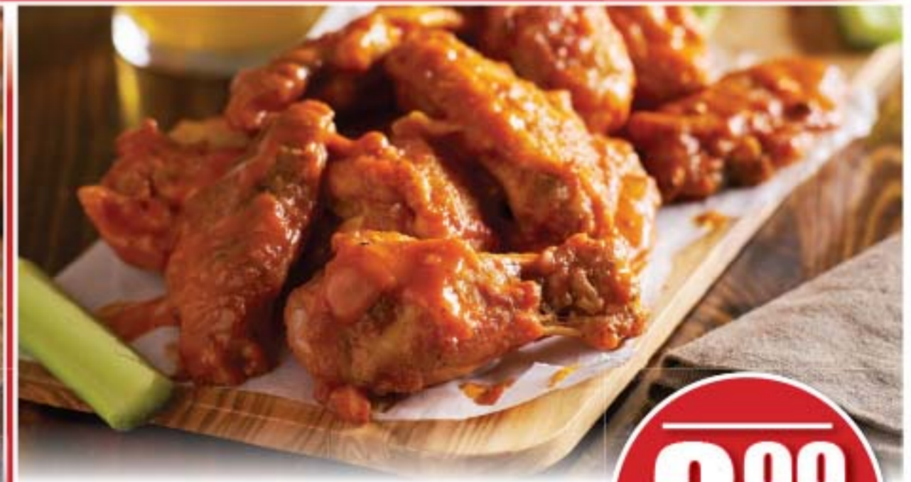
Buffalo Hot Wings