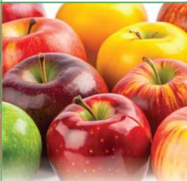
3 Lb. Bag Apples Granny Smith, Red Delicious, Gala or Fuji